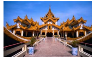
Updated by: AS/11.27.12